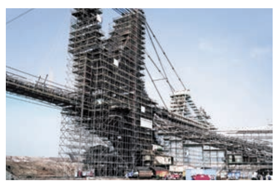
The majority of major projects need special constructions; moreover we are able to supply large quantities of material at very short notice