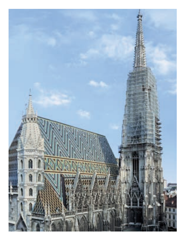
We used a bespoke modular scaffolding system for St. Stephen's Cathedral in Vienna which was erected around the building without the use of anchors